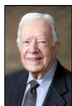
Jimmy Carter, The Carter Center, The Role of Religion in Mediating Conflicts and Imagining Futures: The Cases of Climate Change and Equality for Women (A24-340)