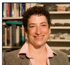
Naomi Oreskes, Harvard University